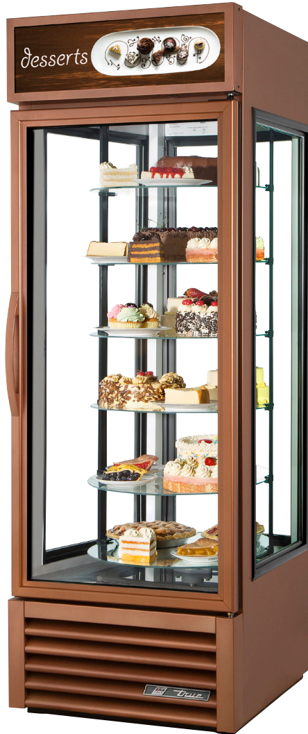
Shown with optional Dessert Sign.

Swing Door Rotating Glass Shelf Refrigerator~True Standard Look Version 01